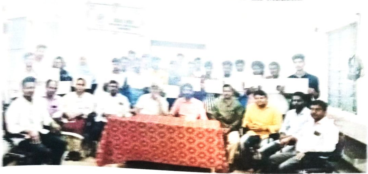
Photo Gallery on the occasion of Certificates issued to the students